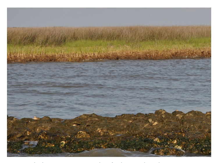
Pictured above is an example of a living shoreline protecting a marsh in the background. With calm, protected waters between the structure and the shore, a diverse habitat for plants and organisms, such as attached animals (like oysters) that provide food for fish and birds, is possible.