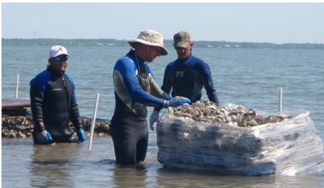
Potential restoration type: oyster reef formation