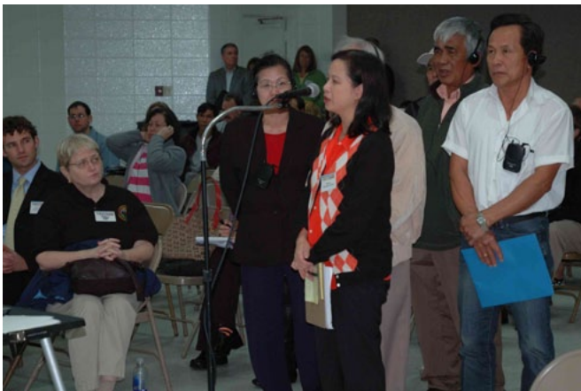
Trustees listen as a citizen comments at a public meeting

In addition to soliciting project ideas from the public, the trustees also listened to public input on the initial round of early restoration projects set forth in the Phase I ERP/EA.