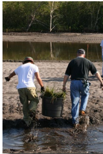
Potential restoration type: planting

NRDAs can be prolonged and complex, in some cases lasting many years. In the case of the Deepwater Horizon Oil Spill NRDA, early restoration is fundamental to beginning the