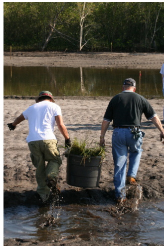
Potential restoration type: planting

A natural resource damage assessment can be prolonged and complex, in some cases lasting many years. In the case of the Deepwater Horizon Oil Spill Natural Resource Damage Assessment (NRDA), early restoration is fundamental to beginning the