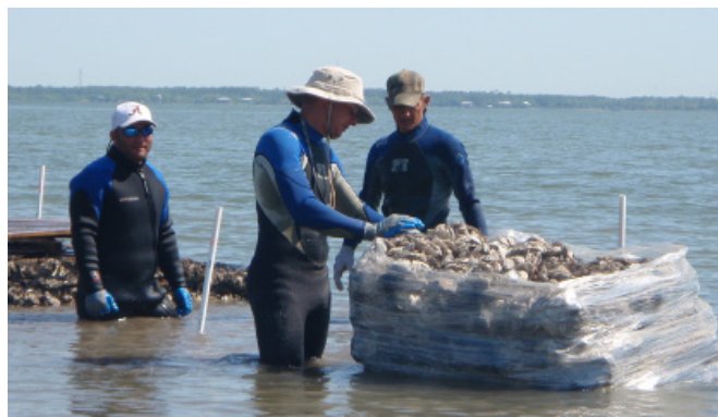
Potential restoration type: oyster reef formation