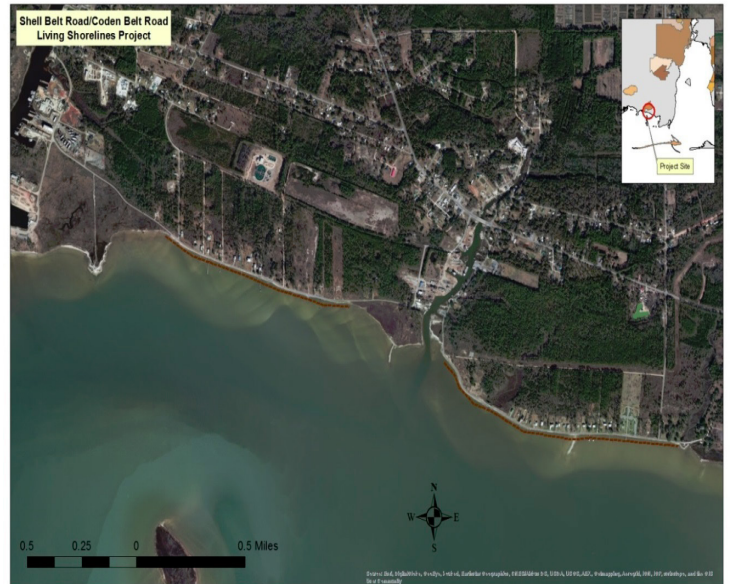
Proposed project site - Shell Belt and Coden Belt Roads Living Shoreline.

As the implementing Trustee for both proposed projects, the Alabama Department of Conservation and Natural Resources would employ living shoreline techniques that utilize natural and/or artificial breakwater material to dampen wave energy to protect shorelines, while also providing habitat and increasing benthic secondary productivity.