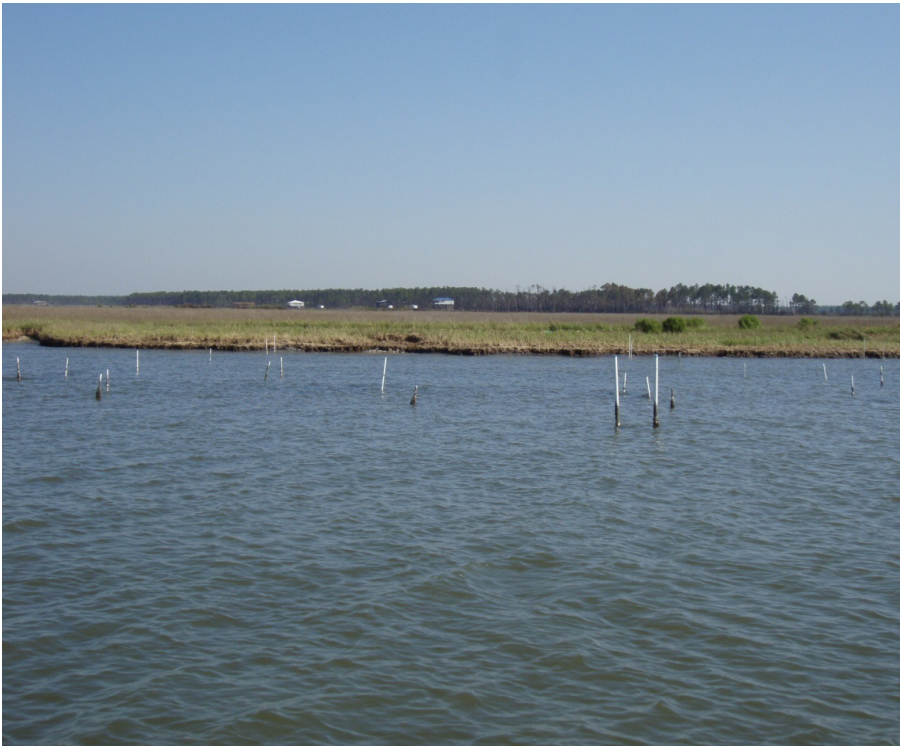
An eroding shoreline in the Mississippi Sound.