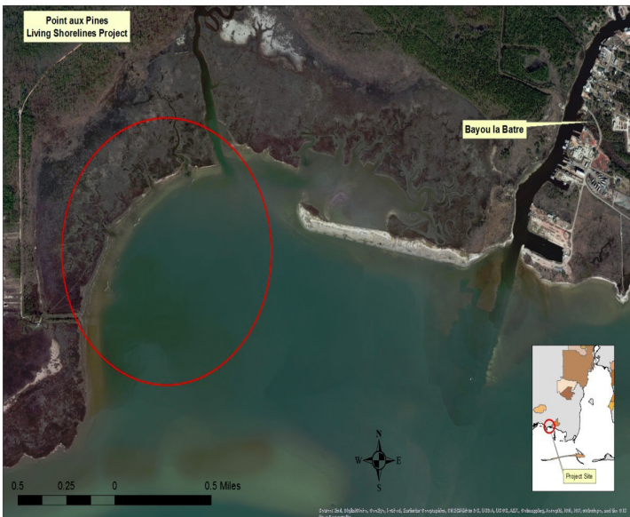
Proposed project site - Point aux Pins Living Shoreline.

Point aux Pins Living Shoreline: $2,300,000