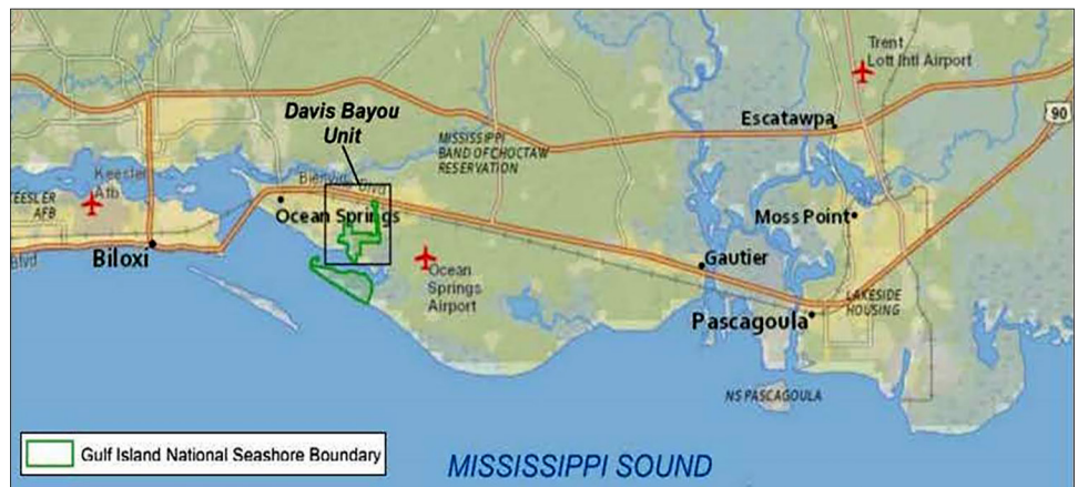
Vicinity Map Gulf Islands National Seashore, Davis Bayou Unit

Members of the public – including day users, overnight campers, and commuters – use this road as walking, jogging, bicycling, and motor vehicle traffic routes. Simultaneous use of the roads by all user groups results in congested traffic and difficult conditions for pedestrians, bicyclists, and motorists.