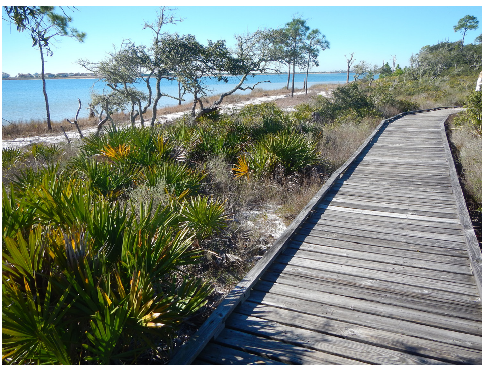
A portion of the existing Jeff Friend Trail as it runs parallel to the shores of Little Lagoon.

The project will replace the 1,250 foot wooden portion of the trail with a composite material boardwalk. The 3,700-foot gravel portion of the trail will be replaced