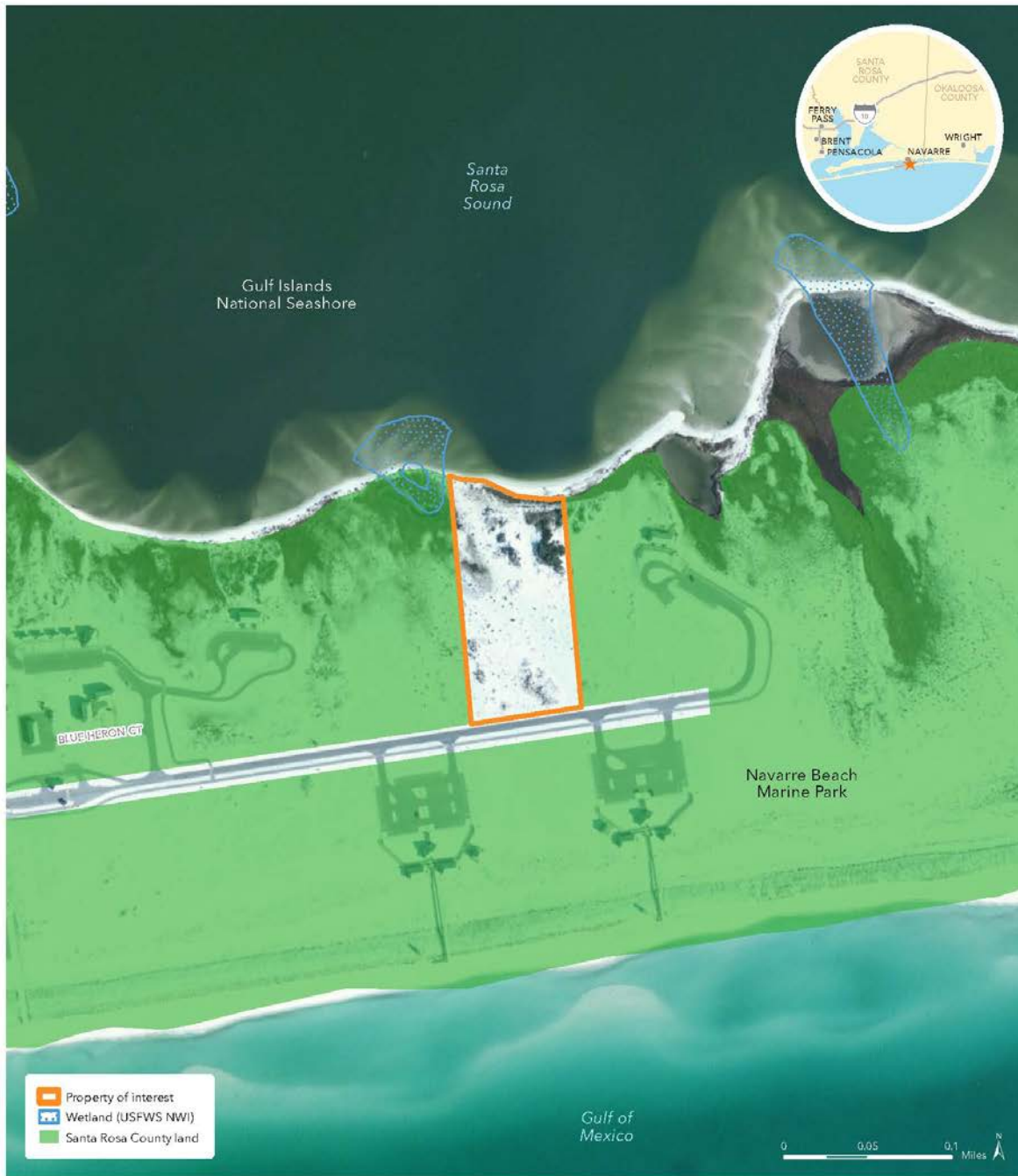
Figure ES-1. Location of the Proposed Alternative