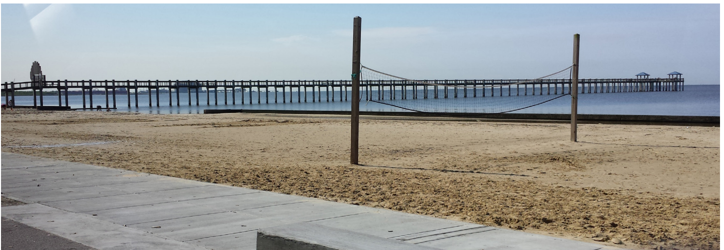
The proposed project would extend the existing pedestrian pathway (pictured above) along the sand beach in Pascagoula.