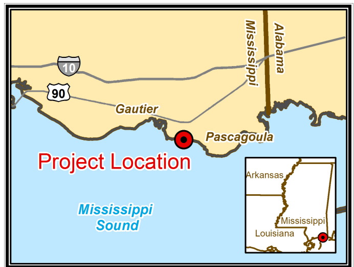
The project is located immediately south of and parallel to Beach Boulevard in Pascagoula.

Program (MsCIP): Hancock, Harrison, and Jackson Counties, MS – Interim Report, and is consistent with existing and long-term local restoration needs and initiatives.