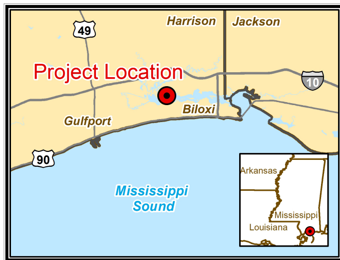
Location of the proposed Popp's Ferry Causeway Park Project