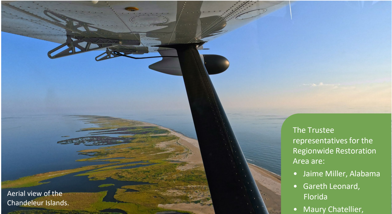
Aerial view of the Chandeleur Islands.

The Trustee representatives for the Regionwide Restoration Area are: