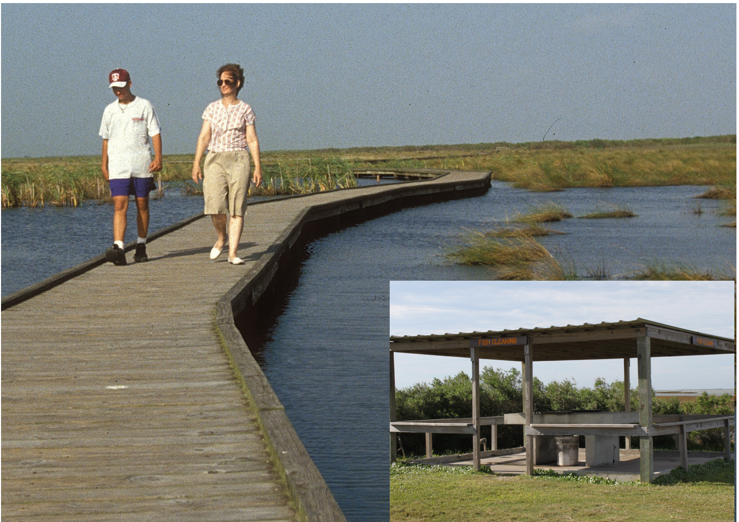
Pictured above are a marsh boardwalk and a fish cleaning station similar to structures proposed in the Sea Rim State Park Improvements project.