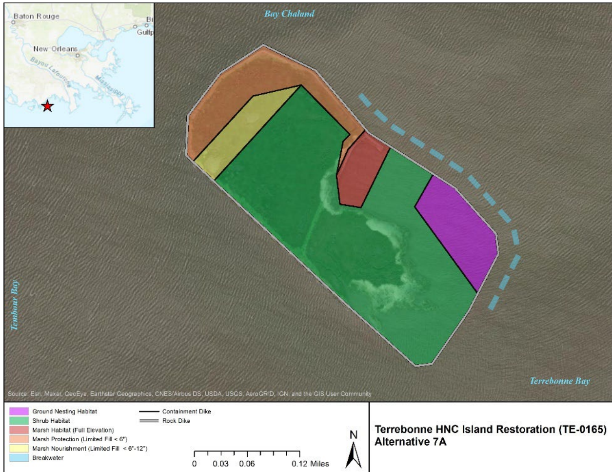
Figure 3-1. Features of Design Alternative 7A.