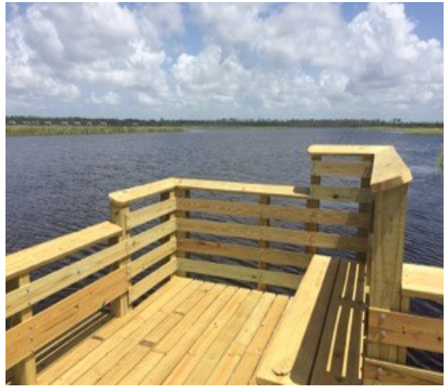
Lake Shelby Fishing Pier, an existing park enhancement that would be accessible from the proposed tram system.

3115 Five Rivers Boulevard Spanish Fort, AL 36527 ALTIG@dcnr.alabama.gov