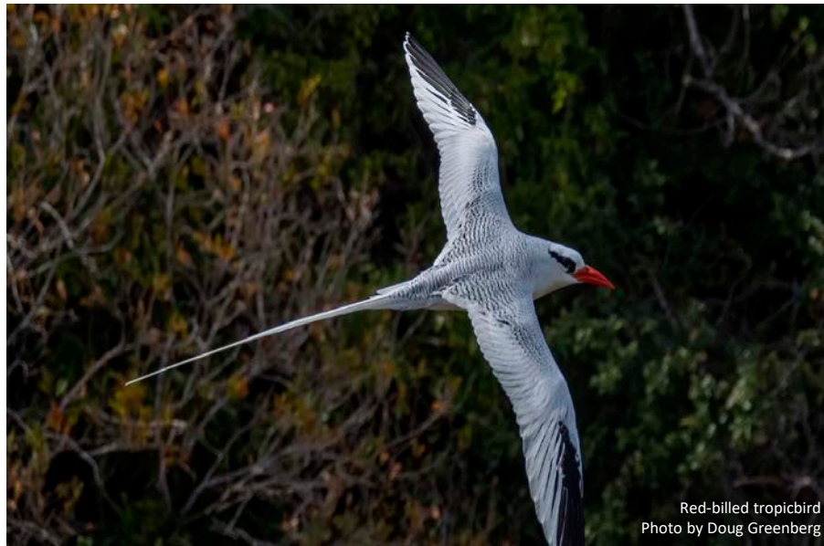
Red-billed tropicbird