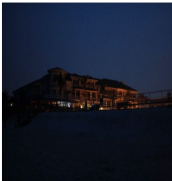
Impacts of light pollution controls: Before and after.